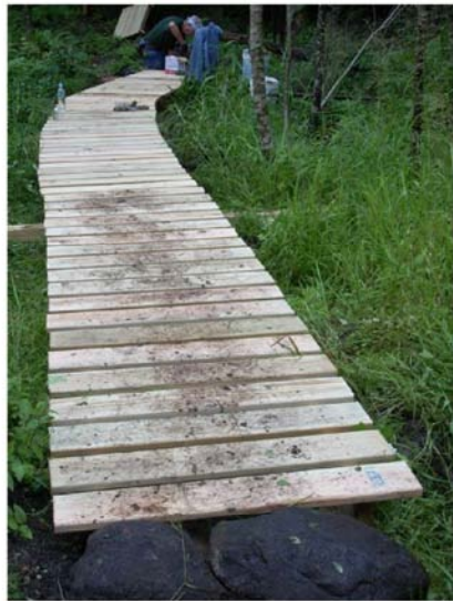
Bridge near West Road. It is located near a rustic cedar bench.

Construction was made possible by a generous grant from the Massachusetts Department of Conservation and Recreation and the New England Mountain Bike Association.