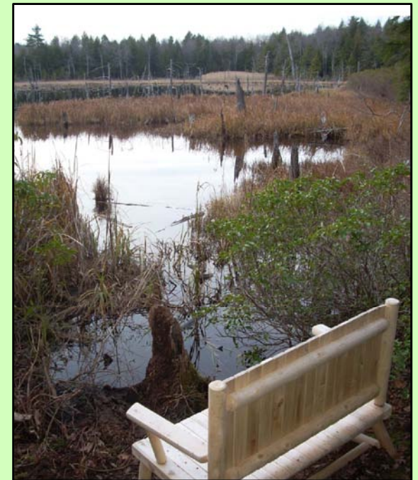
Cedar bench beside beaver pond.